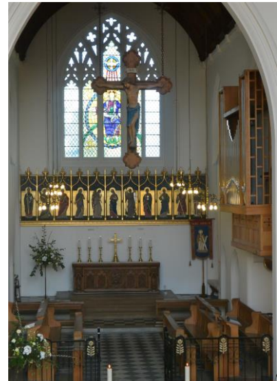
Photo of High Altar taken from Gallery

Vision – we believe God is calling us, over the next 3 - 5 years, to be: