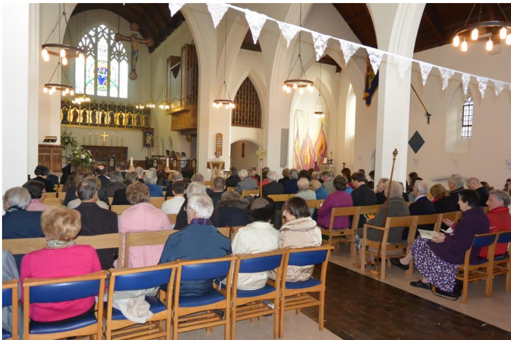
Photo of our Centenary Celebration Wedding Service during National Marriage Week 2014

Morning Prayer is said regularly in church for the people living, working or studying on every street in the parish of St. Andrew's. We also continue to show the love of God through practical acts of friendship, hospitality, service and care for those we encounter in our daily activities.