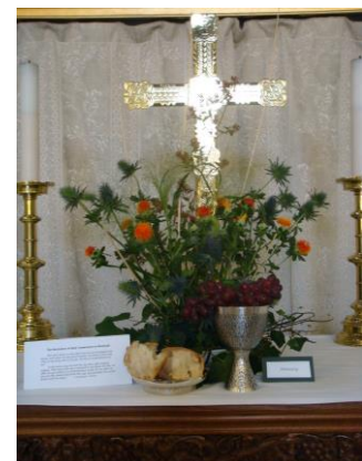
Photo of Altar at Flower Festival