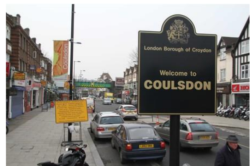
Photo of Coulsdon Centre looking south

The church lies to the west side of Coulsdon, just 5 minutes' walk from the town centre.