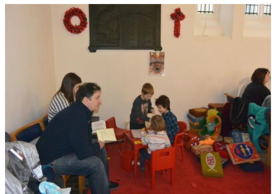
Photo of Children's corner, back of church

Children are involved in arts and crafts relevant to the bible teachings and then return to Church in time for Communion followed by "show and tell".