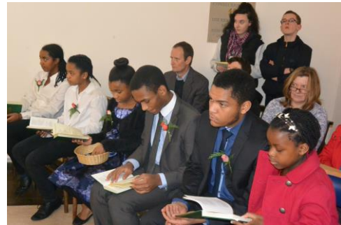
Photo of our some of our young people during Marriage celebration

Our Priority Goals for the next 2 - 3 years are to: